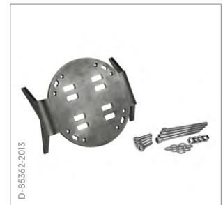
Pole Mounting Kit Attach Polytron 5000/8000 series to a pole or pipe using clamps (not included).