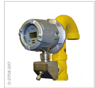
Vent Monitoring A custom 2" vent line monitoring system to detect and record gas releases.