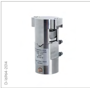
Process Sampling Adapter Analyze process streams with a PIR 7000 sample draw systems.