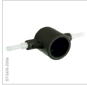
Calibration Adapter FKM rubber calibration adapter for all CatEx and EC DrägerSensors®.