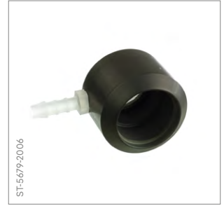
Remote Calibration Adapter Allows calibration of sensors in hard to reach places.