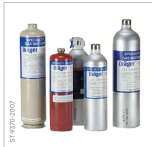
Calibration Gases Select from a large variety of certified cal gases designed for calibrating every sensor type.