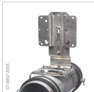
Duct Mounting Kit Monitor inside ventilation ducts. Rail system allows for easy sensor removal for preventive maintenance.