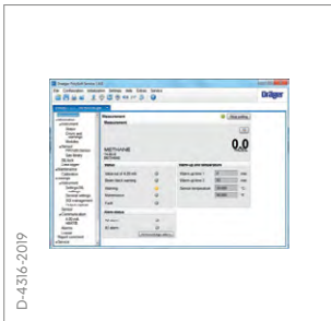
Dräger Polysoft Software Windows software for managing all Dräger gas detection transmitters via HART®, IR® or Bluetooth®