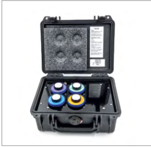
Bias Box for 4 Sensors Maintains up to 4 EC sensors in operational state to reduce warm up time after installation in transmitter to just a few minutes.