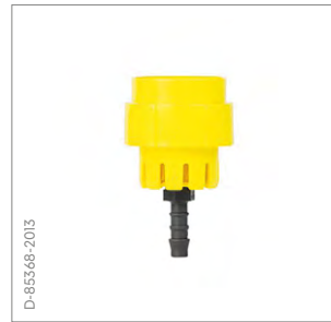
Splashguard An accessory to prevent dust and water from collecting on the toxic and combustible sensor.