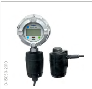
EC Sensing Head Remote Mount EC sensor up to 30 meters away from Polytron® 5100/8100.