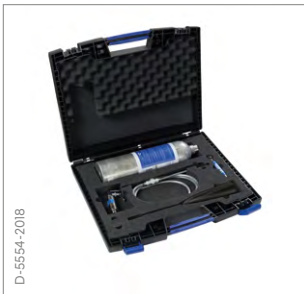
Polytron Calibration Kit Basic calibration kit with zero gas cylinder and space for a span gas cylinder. Includes all the needed accessories in a convenient carrying case.