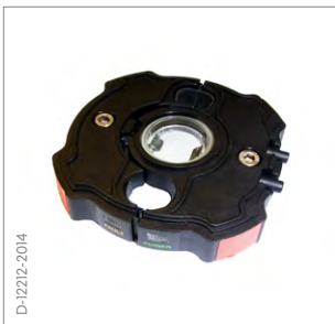
Flow Cell for IR Sensor Remotely calibrate Polytron 5700/8700 sensor inside a duct or remote location with tubing.