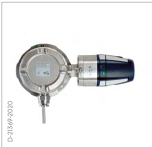
Remote Sensor Junction Box The explosion-proof junction box allows remote mounting of an IR or CatEx sensor up to 30 meters.