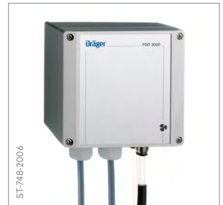
PSD 3000 Sampling Unit Sampling pump for non-hazardous areas. Adjustable flow rate with a flow switch and LEDs.