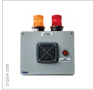
Remote Alarm Station Dräger provides various audio & visual notifications.